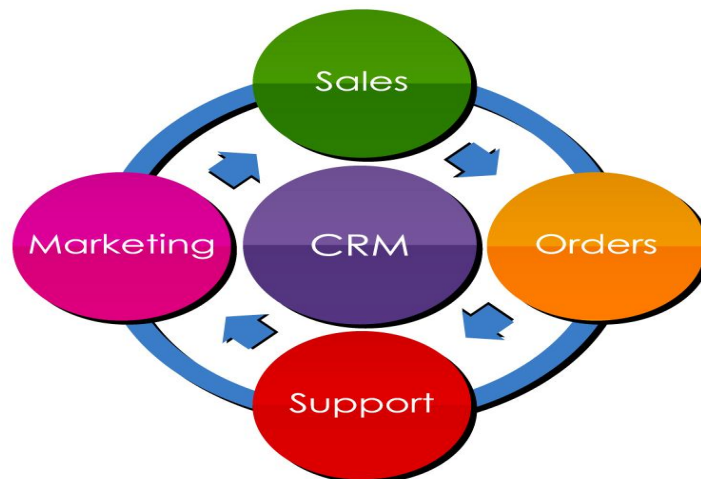
Figure 2 Cycle of CRM [9]

As cited in earlier sections, CRM is one of the most practical areas of DM. In general, DM has been entered in all fields of CRM, particularly in customer retention field. This point of the CRM is considered as central module of CRM cycle and has great significance. Customer happiness which refers to the difference among the customer's present condition and his hopes are considered as a necessary requirement for customer retention. Customer's faithfulness programs, which are located in this phase as one of the major components, include efforts and supportive activities with the objective of retention the long term associations with customers. Customers perform mechanical analysis; quality of services (QOSs) and customer satisfaction are considered as customer loyalty programs [6]. According to investigations, almost all DM tools have been used in CRM area.